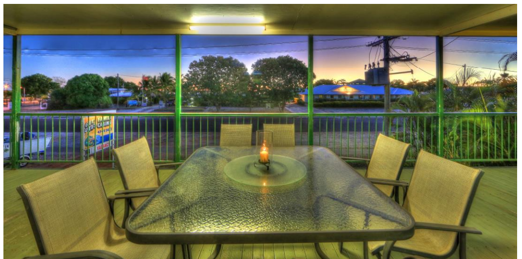
Residence Front Deck