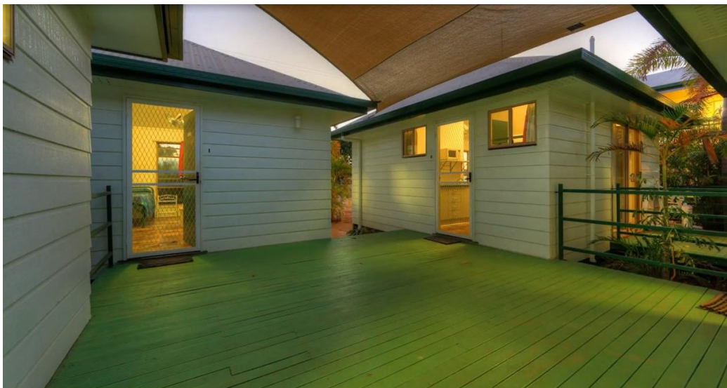
Cabins Common Deck